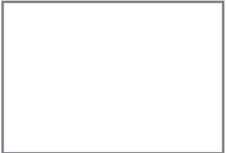
YOUR TEXT CLIPPING MASK