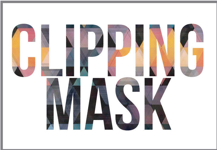
MY TEXT CLIPPING MASK