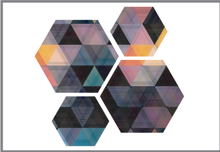
MY SHAPES CLIPPING MASK